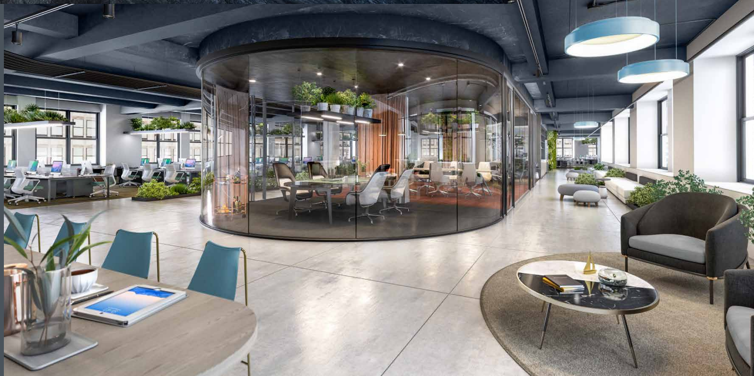
■ Sample Installation